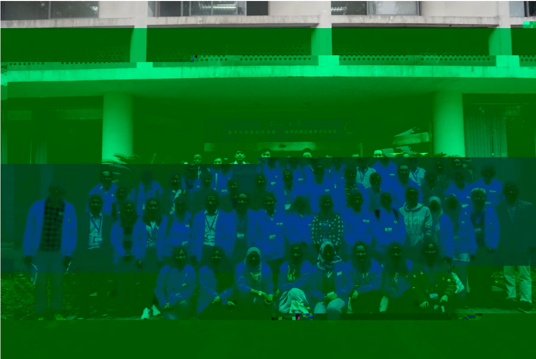
第三届中国政府海洋奖学金游学活动合照，2017年11月13日至16日，同济大学 Group photo of 3 rd Marine Scholarship of China exchange program, Nov. 13 to 16, 2017, Tongji University